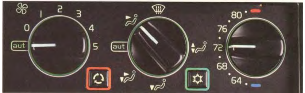
Electronic climate control system is a powerhouse when it comes to modulating air quality and climate -front and rear. Actually employs four separate sensors: to measure sunshine intensity, interior temperature, heat exchanger temperature, and outside air temperature.