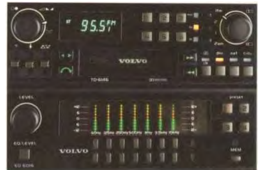
Sensitive and powerful four speaker AM/FM stereo audio system offers cassette receiver with high power amplifiers. System includes clock, 24 station presets, separate bass and treble controls, scan tuning, night illumination. And seven-band graphic equalizer.