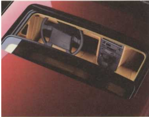
Power sliding glass moonroof - with sliding sunshade inside.

But the 780 coupe adds something to the special performance, luxury, and comfort that Volvo is famous for. It adds a mystique all its own.