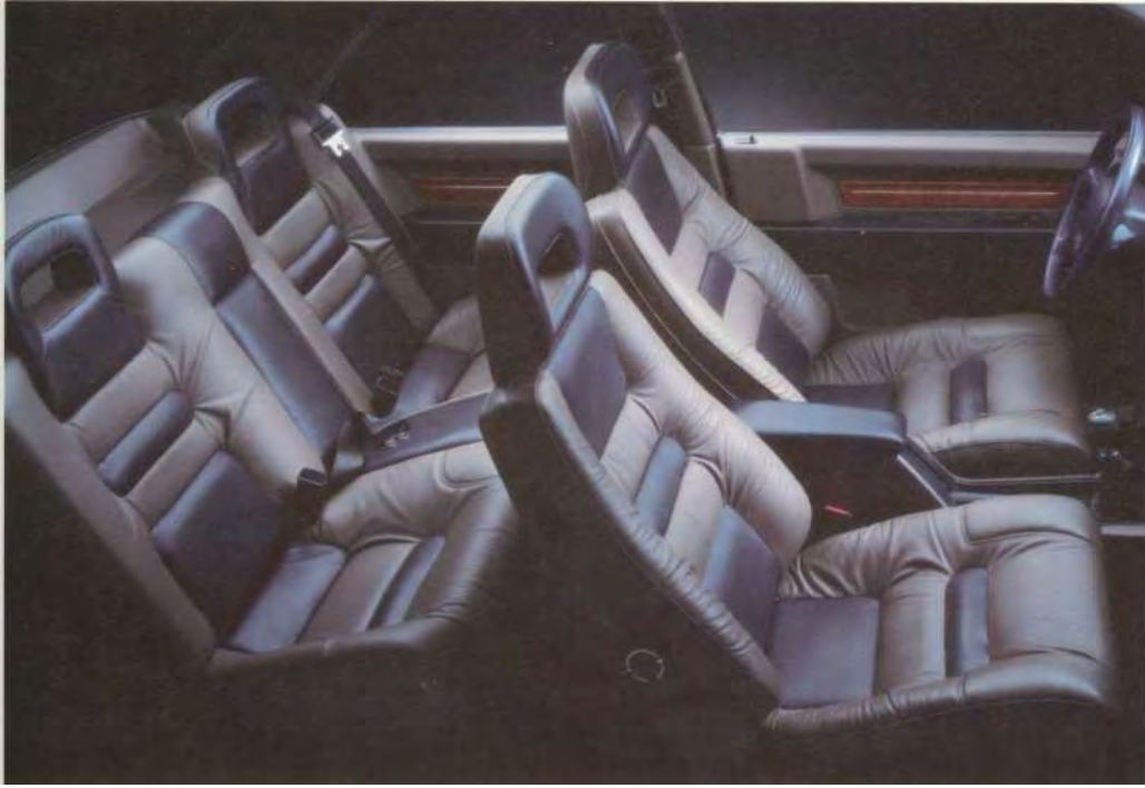
Heated, orthopedically-designed front bucket seats help cradle the body. Offer 8 different adjustments at the touch of a button. Feature manually operated lumbar support, too.